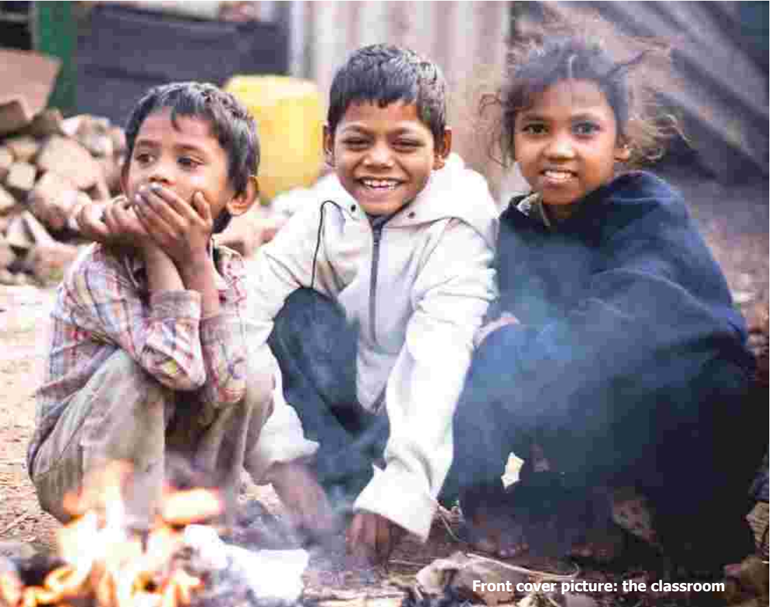
Front cover picture: the classroom

There is no doubt, however, that the most rewarding students from a personal point of view were the boys I taught in evening classes at the Second Chance School where I lived.